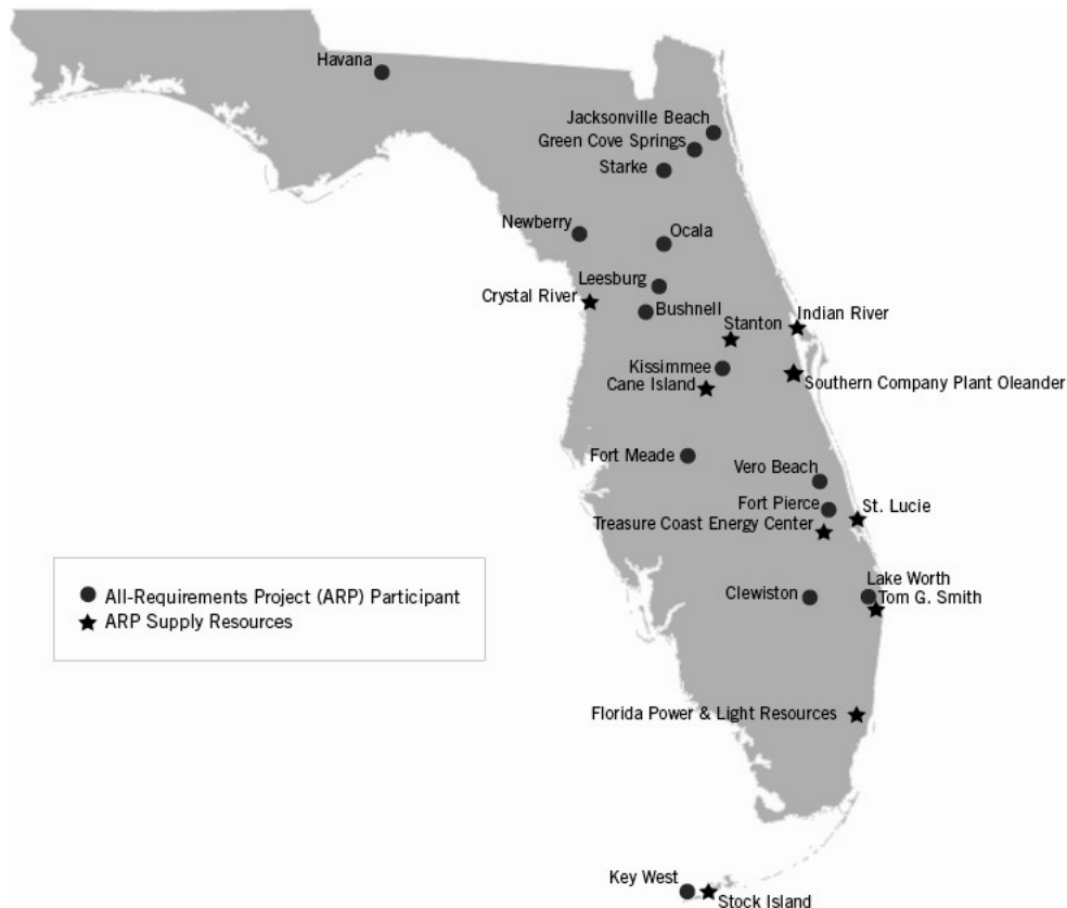
Figure ES-1 ARP Participants and FMPA Power Supply Resource Locations

A location map of the ARP Participants and FMPA's power resources as of January 1, 2011 is shown in Figure ES-1.