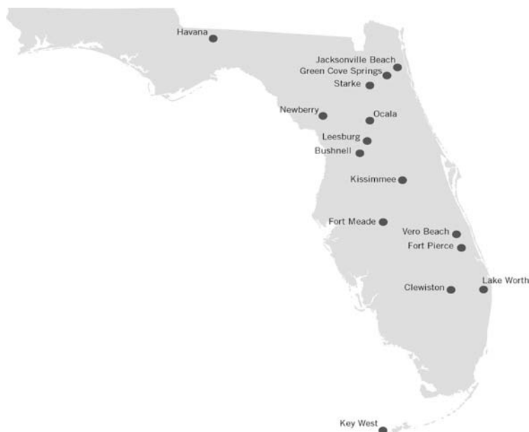
Figure 1-1 ARP Participant Cities

On December 9, 2004, the City of Vero Beach provided notice to FMPA, pursuant to the All-Requirements Power Supply Project Contract, that it was going exercise the right to modify its ARP full requirements membership and request and establish a Contract Rate of Delivery (CROD) which began January 1, 2010. On December 17, 2008, the City of Lake Worth provided notice to FMPA that it will exercise the right to modify its ARP full requirements membership and establish a CROD beginning January 1, 2014. In addition, on July 14, 2009 the City of Fort Meade provided notice to FMPA that it will also exercise its right to modify its full requirements membership and establish a CROD beginning January 1, 2015. The effect of these notices is that the ARP will no longer utilize these ARP Participant's generating resources (if any), and the ARP will commence serving the load of these ARP Participants on a partial requirements basis. The amount of the partial requirements for Vero Beach served by the ARP has been established as zero MW, and the amount of the partial requirements for Lake Worth and Fort Meade served by the ARP will be established in 2013 and 2014, respectively.