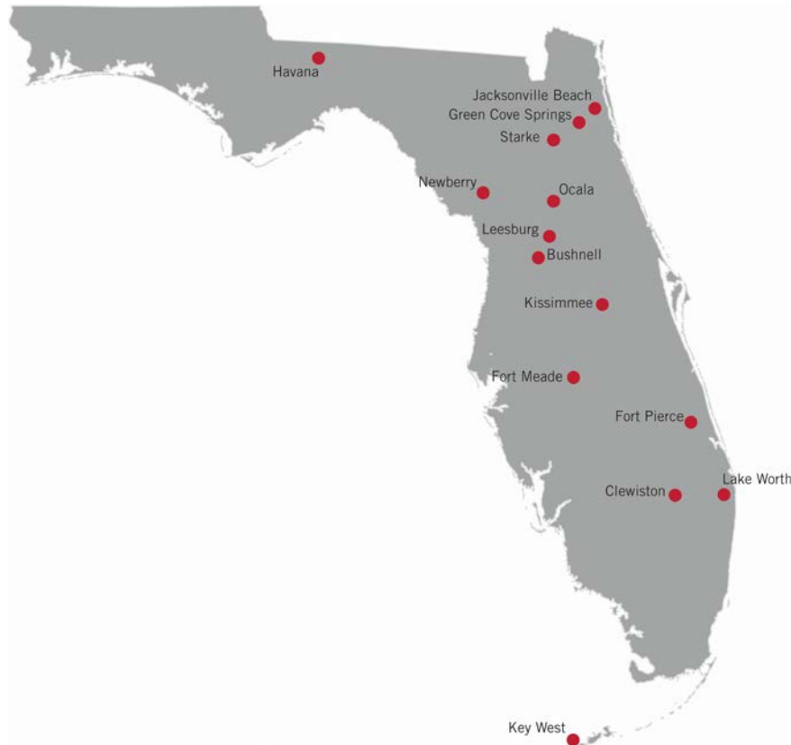
Figure 1-1 ARP Participant Cities

Following is a brief description of each of the ARP Participants who is provided capacity and energy from the ARP.