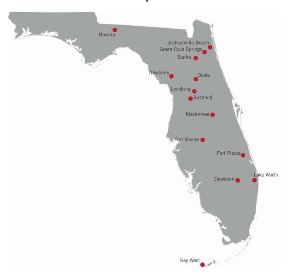
Figure 1-1 ARP Participant Cities

Following is a brief description of each of the ARP Participants who is provided capacity and energy from the ARP.