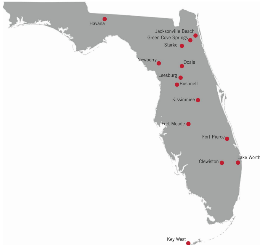
Figure 1-1 ARP Participant Cities

Following is a brief description of each of the ARP Participants.