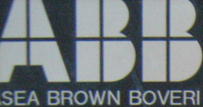
ABB POWER T & D COMPANY INC.

PHASE HERTZ TYPE SL FORM FORMER DA / FA INSULATION