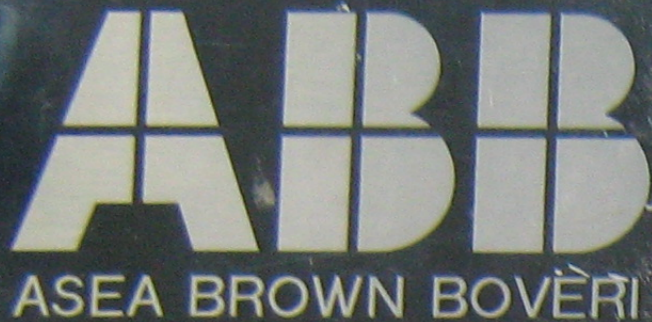
ABB POWER T & D COMPANY INC.

THREE PHASE 60 HERTZ TYPE SL GSU TRANSFORMER CLASS DA/FA MOLDUR INSULATION